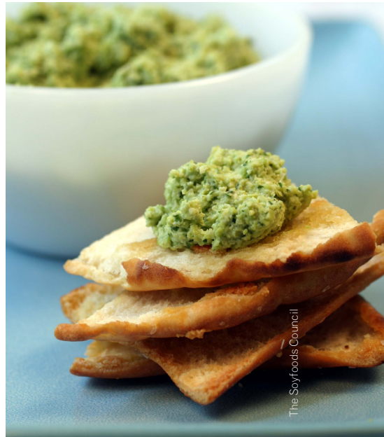
The Soyfoods Council

As we cast our net for insights and ideas from our panel of experts, we brought in a bounty of ideas that serve as great musings for trends and innovations to come. We call it our Idea Jar. Pull one out and see where it takes you.