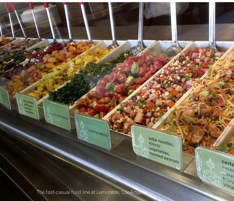
The fast-casual food line at Lemonade, Los Angeles

While those on the cutting edge of food trends—chef-driven restaurants, gourmet food purveyors—are watching Peruvian cuisine, Scandinavian fare and fennel pollen, our group of experts shared some more mainstream trends worth exploring.