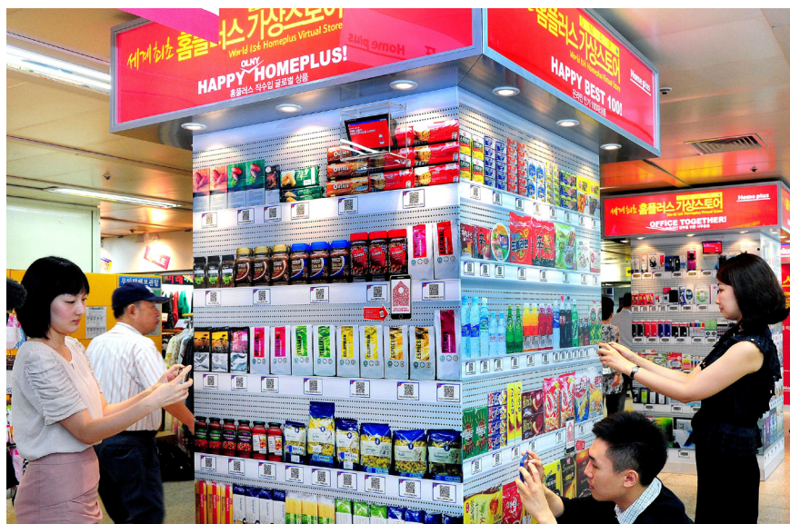
Tesco's ordering wall allows consumers to shop using QR codes.

would be a great add-on to bring fresh foods to the working person who arrives home from a commute famished, and might like something better than a frozen or boxed meal," she says. "Really, at that point, all you want is comfort and relaxation."