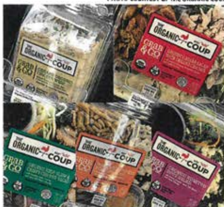
The Organic Coup's salads and wraps feature clean labeling and organic ingredients.