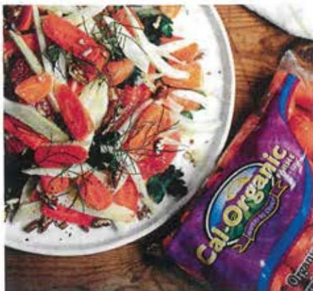
A carrot fennel citrus salad featuring organic carrots from Grimmway Farms.

availability and a larger network of organic providers, Baldor is helping more foodservice businesses become aware they can incorporate organic produce into the menus successfully."