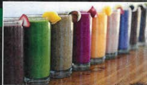
The Fruitive in Washington, DC, and Virginia offers a variety of power-packed juices (above) such as Katevolution and Beet Faster, that contain organic produce.